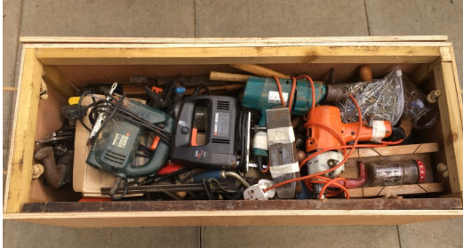
Example of a kit sent out to refugees or to projects in Africa.

The Shedders get a great deal of satisfaction from their work as Tool Shed volunteers, David Smith tells us "It's fantastic to be involved in this project knowing that our carpentry kits will make such a difference to the refugees in Samos and other projects around the world".