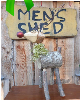
St Andrews Men's Shed