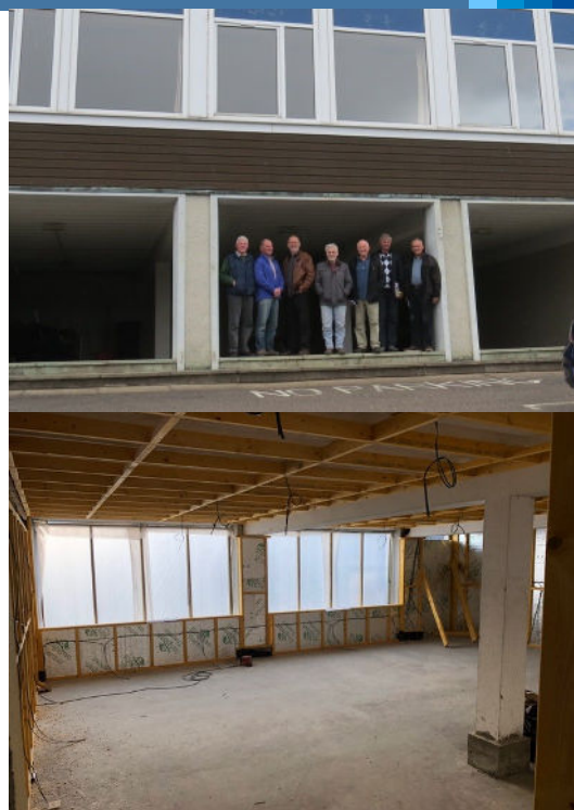
Pictured (top): The Legion's garages and undercroft before Phase 1 began

Keep up-to-date with progress on their website or Facebook and Twitter pages.