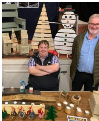
Broadford & Strath Men's Shed