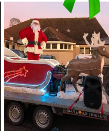
Kinross & District Men's Shed