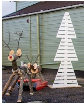
Stonehaven Men's Shed