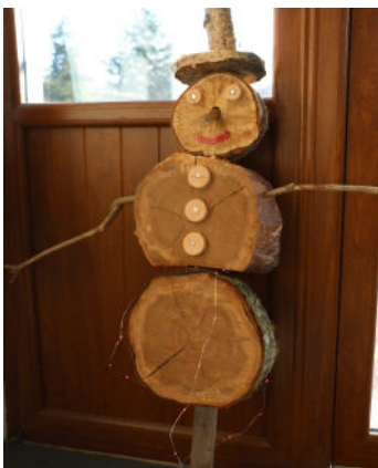
Banchory Men's Shed