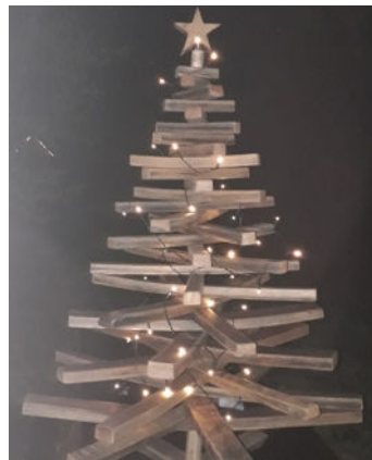
Forres Men's Shed