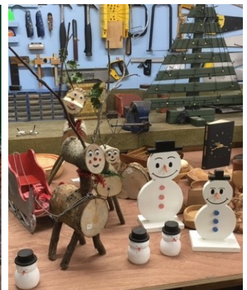
Ellon Men's Shed