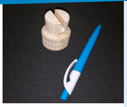
The mystery object

"One other important point is that we explain that these devices are one of the first items that a Wee County Shedder, learning to use a woodlathe, is taught how to make. Often it is the first thing they have